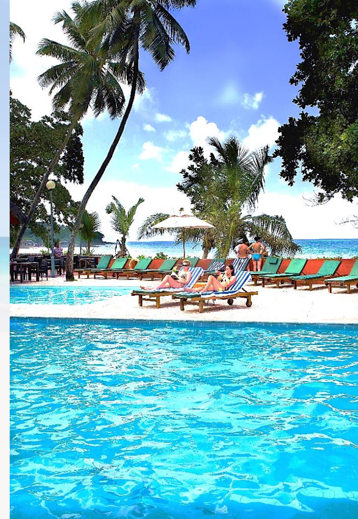
Berjaya Beau Vallon Bay Resort