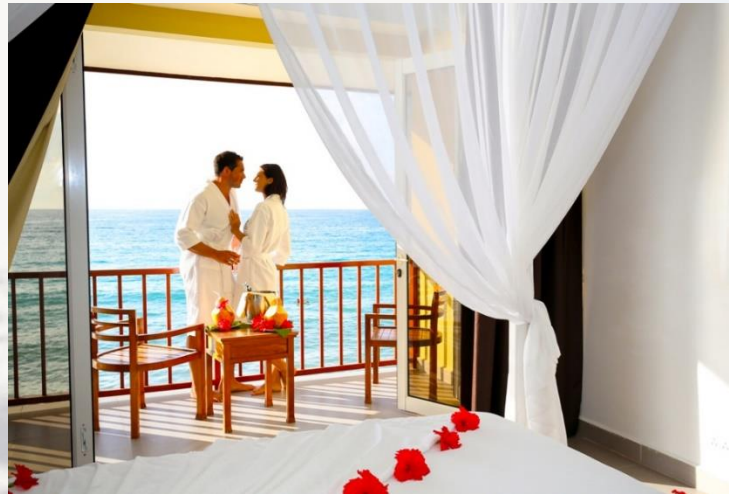
Coral Strand Smart Choice Hotel