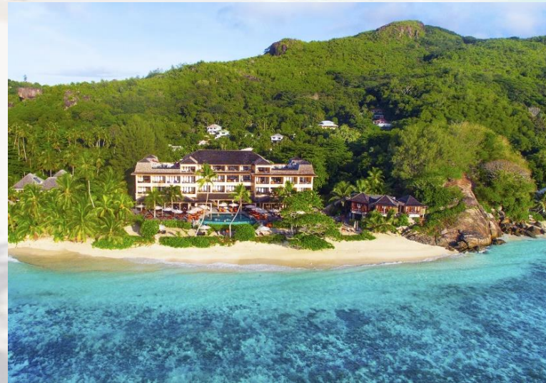
Double Tree by Hilton Seychelles Allamanda Resort & Spa