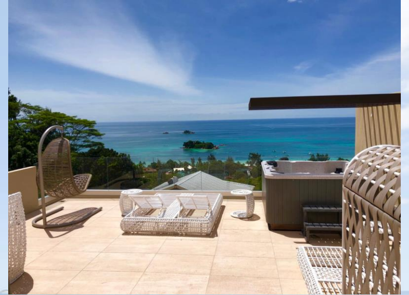
Le Duc Villa