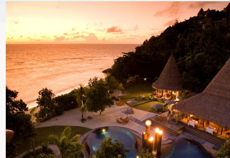
Anantara Maia Seychelles Villas