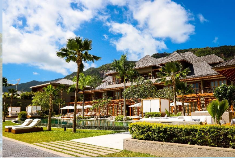
L'Escale Resort Marina & Spa