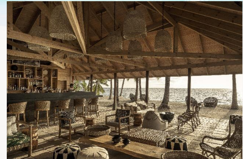
Four Seasons Resort Seychelles at Desroches Island