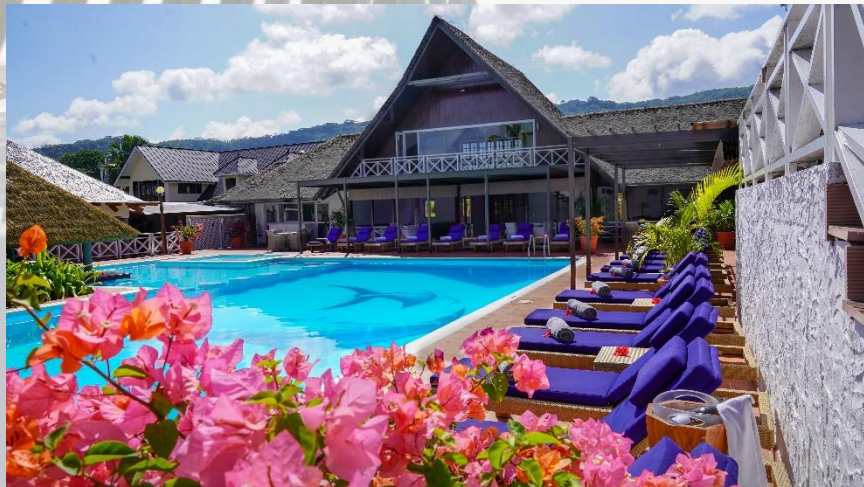
La Digue Island Lodge