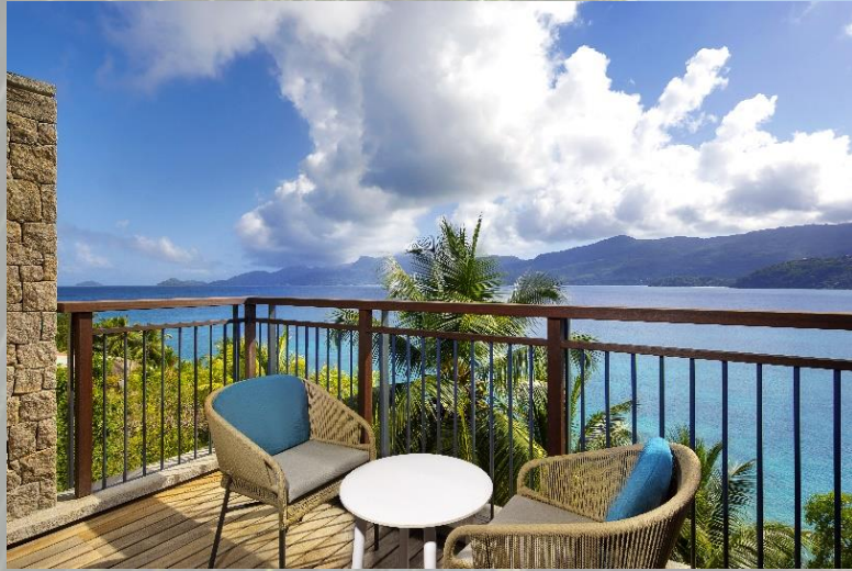
Mango House LXR Hotels & Resorts