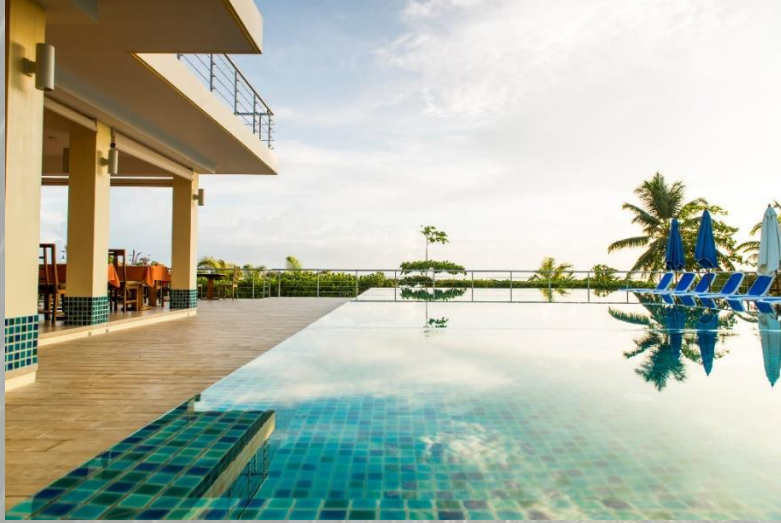
Acajou Beach Resort