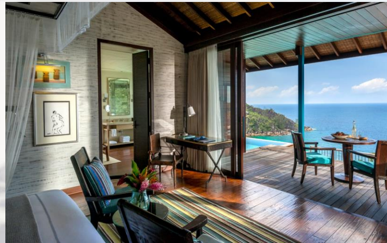
Four Seasons Resort Seychelles