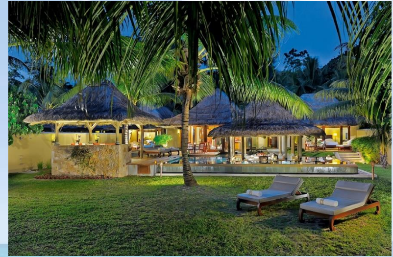
Constance Lemuria Resort