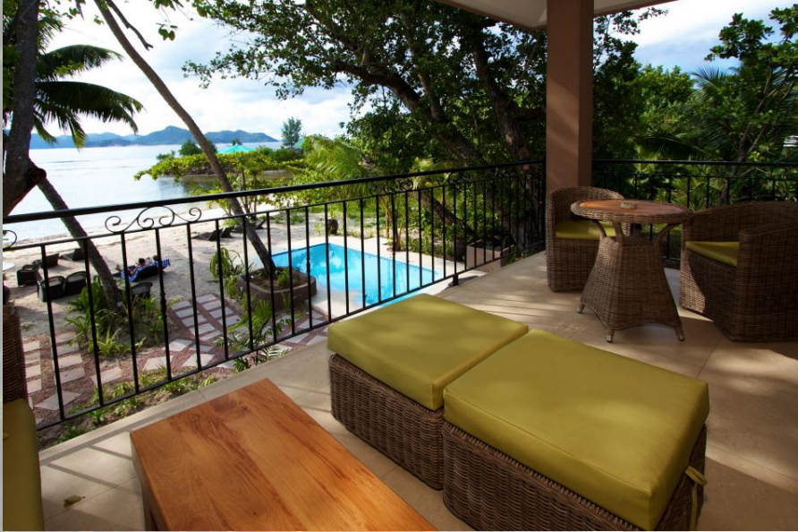
Le Repaire Boutique Hotel & Restaurant