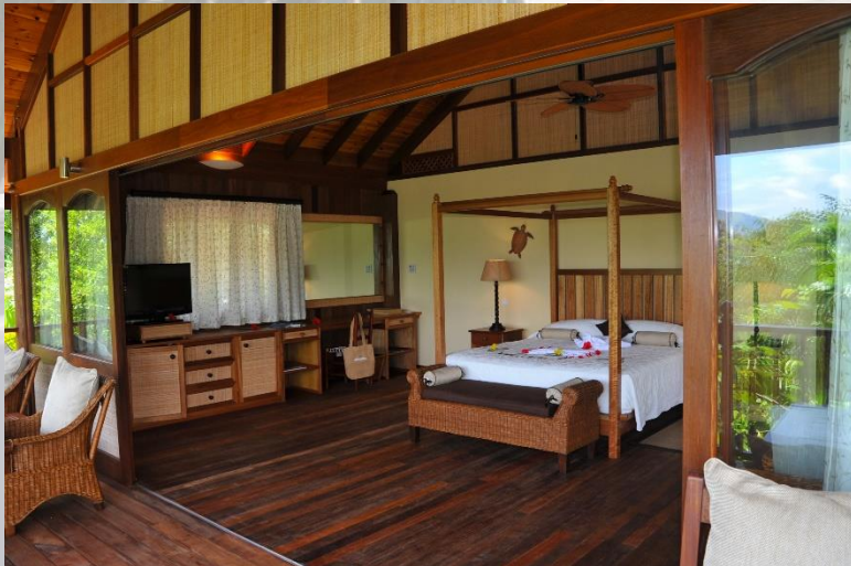
Cerf Island Marine Park Resort